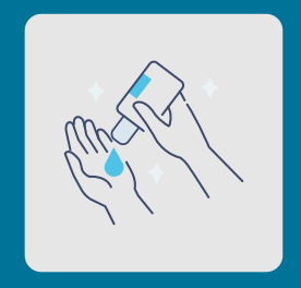
WASH your hands often. If soap and water are unavailable, use a hand sanitizer.